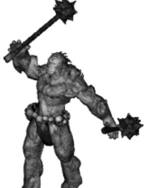
Ther the Trow Lord